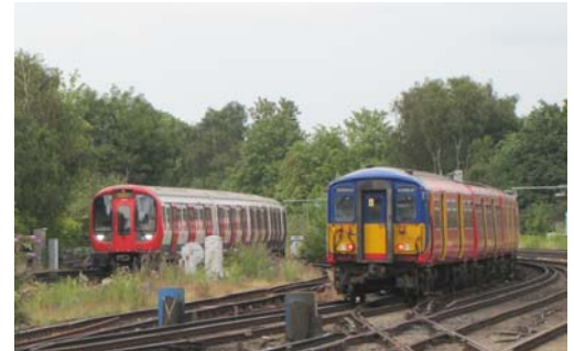
TfL S Stock and SWT 5726 at Wimbledon 26 th July 2016

VISIT THE RCTS WEBSITE www.rcts.org.uk FOR ADDITIONAL INFORMATION