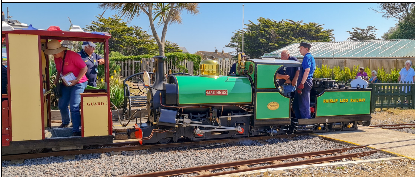
Above: “Mad Bess”, Ruislip Lido Railway’s 2-4-0T + Tender, starts away from the Norfolk Road terminus heading for Mewsbrook Park. The Guard and ticket inspector taking their seats at the last moment!!