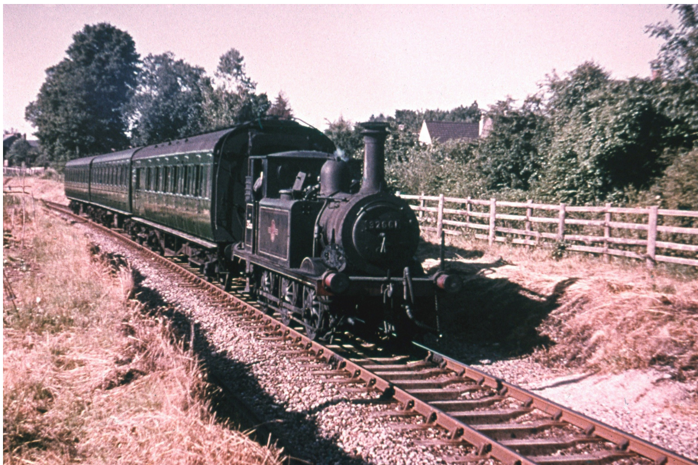
Above: A1X No 32661 is approaching Langstone.

These Images from John Barrowdale's collection were originally taken on Perutz film. It was known for having warm tones! All pictures taken in 1961.