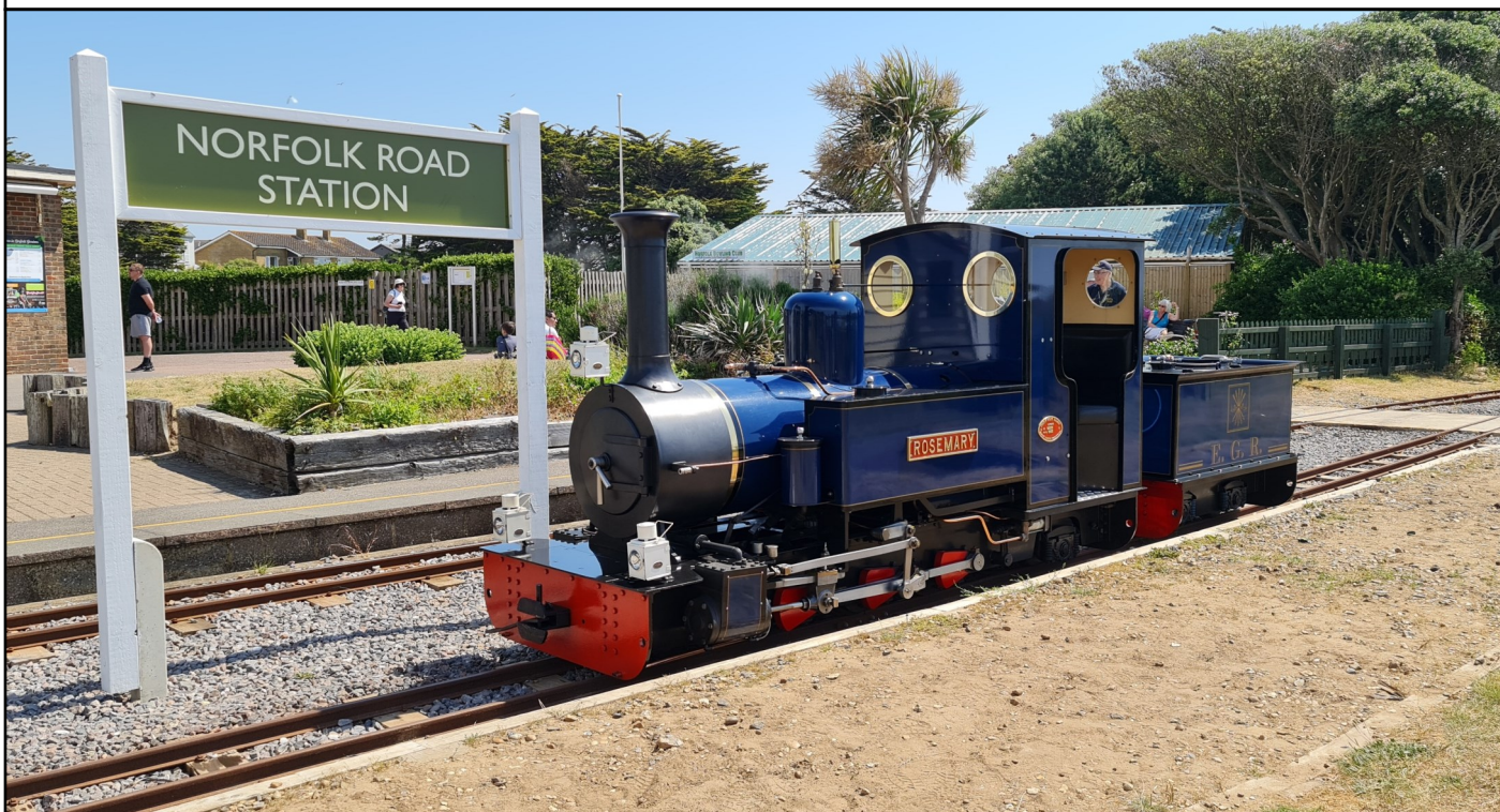
“Rosemary” poses for the photographers in the sunshine at Norfolk Road.