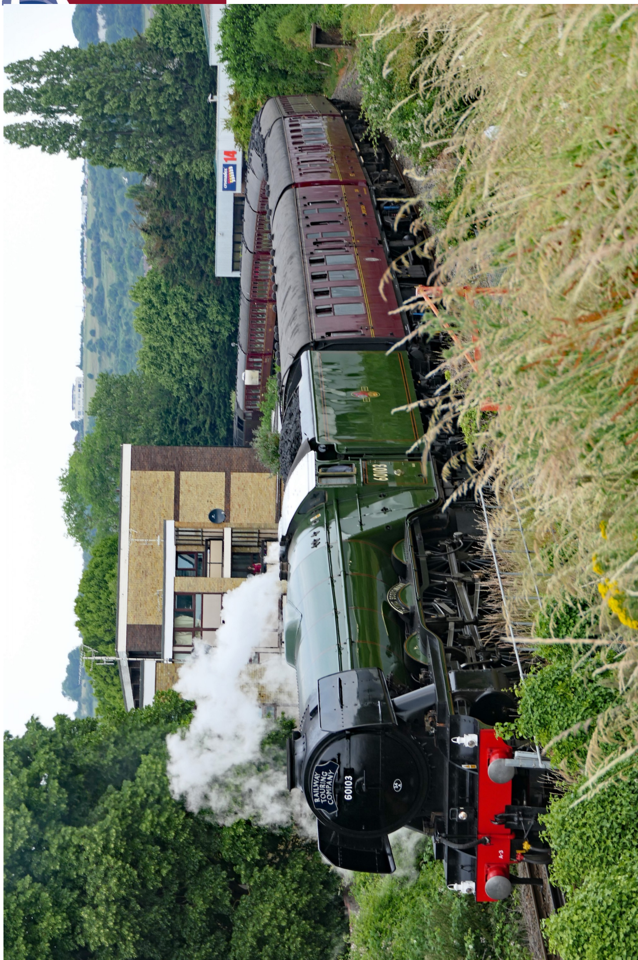
LNER 60103 “ Flying Scotsman ” is seen on the Cosham triangle between Cosham and Portcreek Junctions on 17th June 2023. The train, run by the Railway Touring Company is 1Z72: 08:45 Victoria to Portsmouth Harbour.