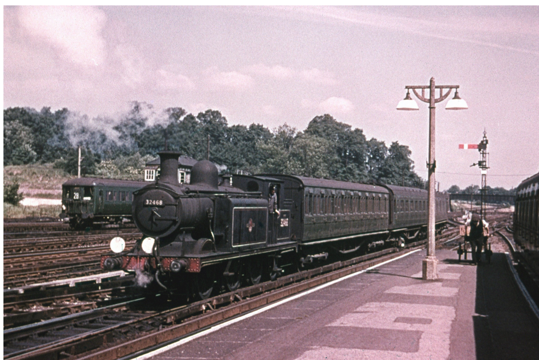
Below: E4 0-6-2T No 32468 is coming into Guildford