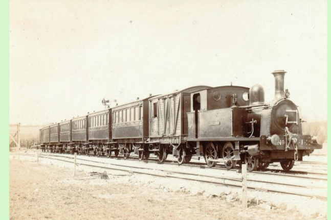
Image left of the Opening of the Rother Valley Railway 1900.