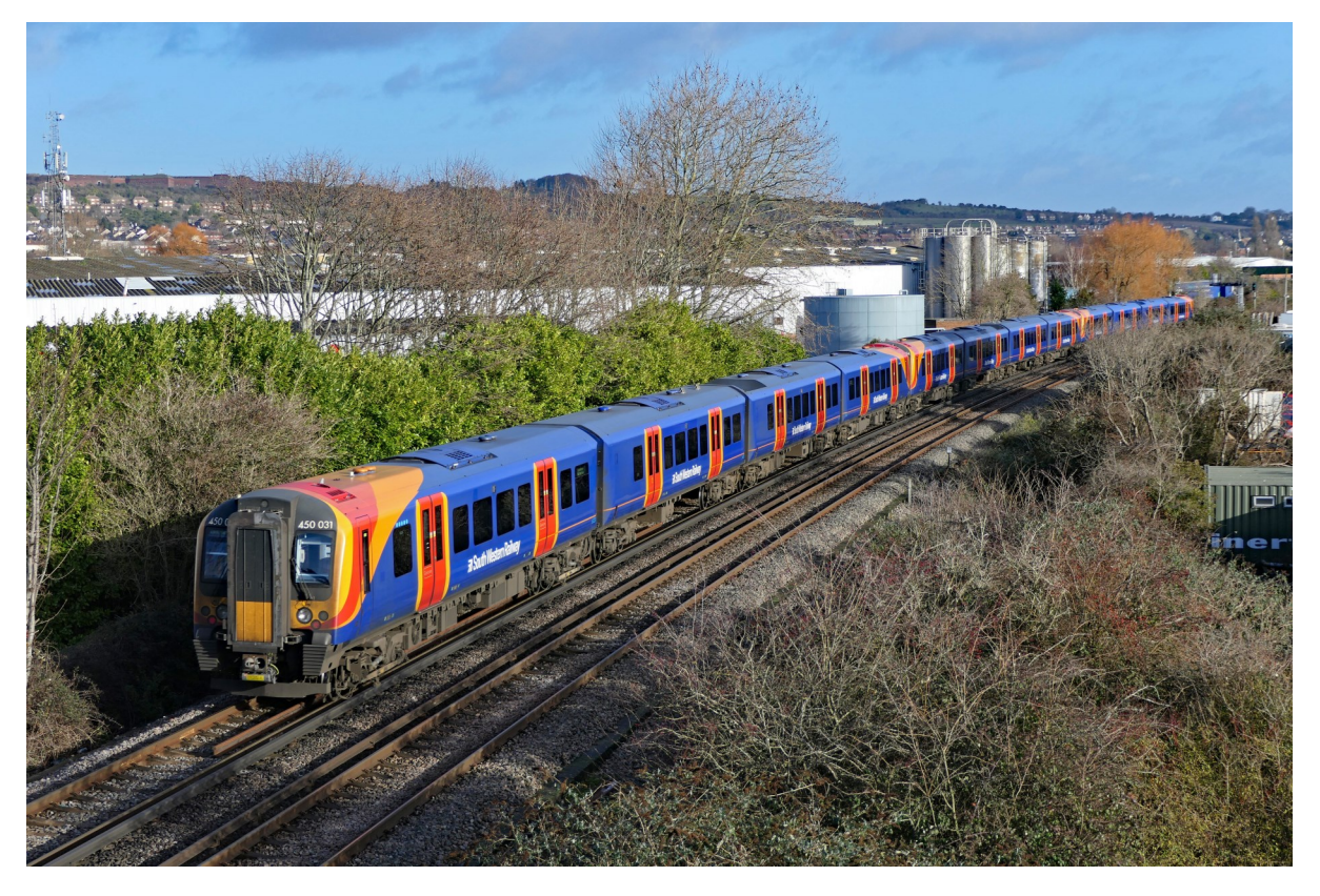
Three SWR Class 450s form the 10:45 Portsmouth Harbour to London Waterloo approaching Farlington Junction. 23 December 2019.