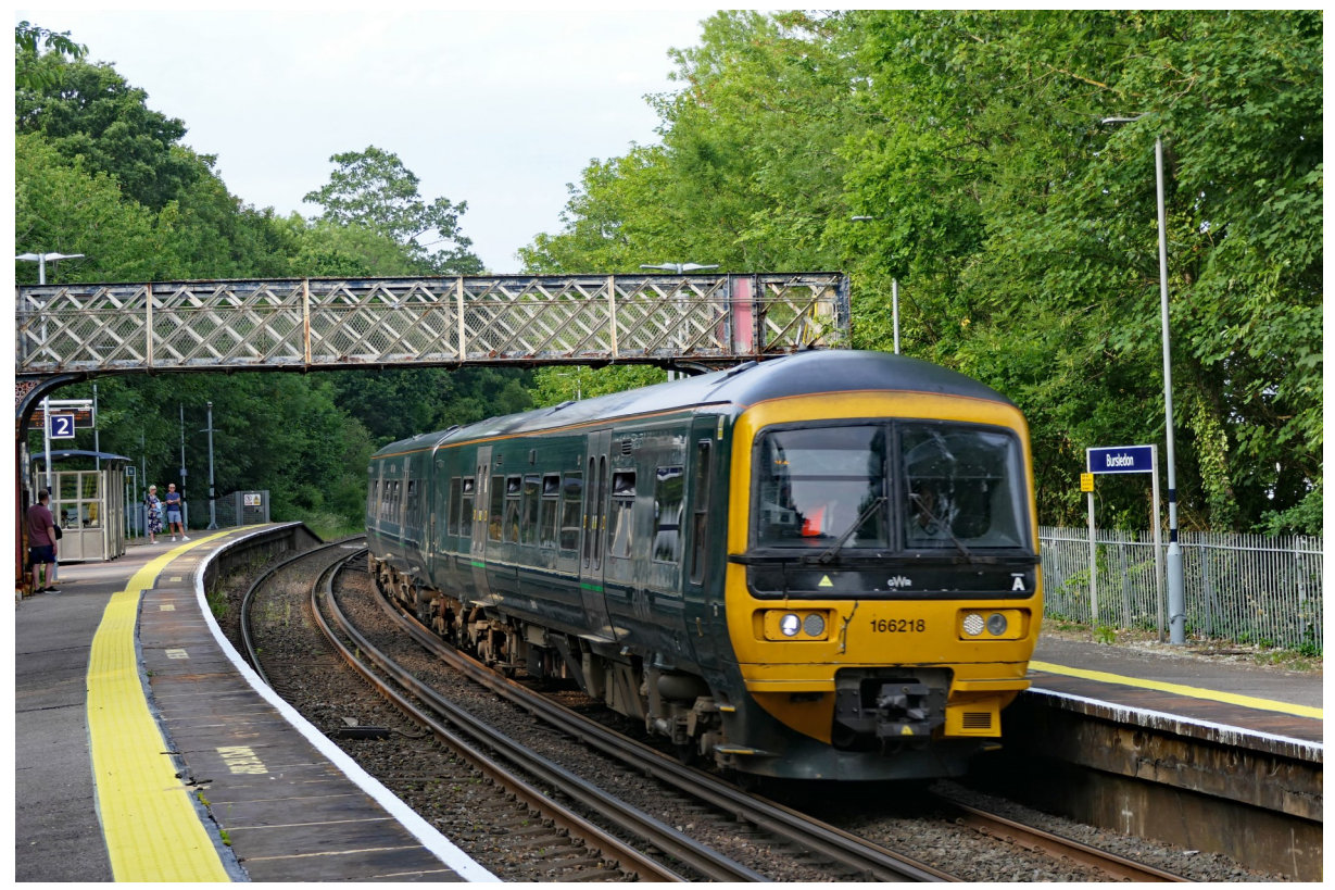
A GWR Class 166 heading the 17:23 Portsmouth Harbour to Cardiff Central is passing through Bursledon. 17 June 2023.