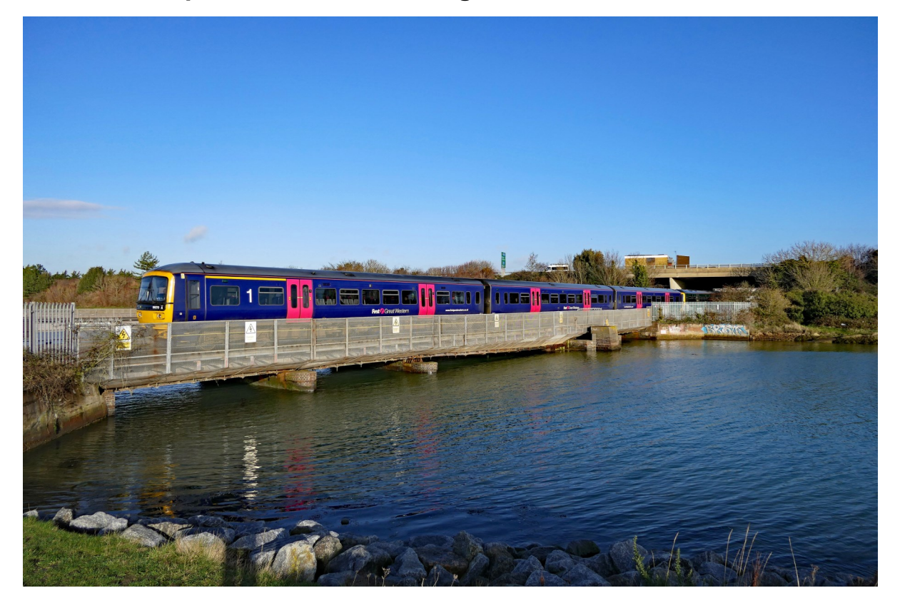
Pre-Covid 23 December 2019 a GWR Class 166 crossing Portcreek Junction with the 07:30 Cardiff to Portsmouth Harbour service.