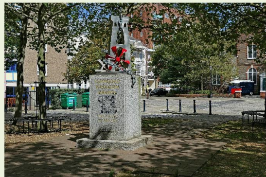
I K Brunel Born Portsea 9 April 1806