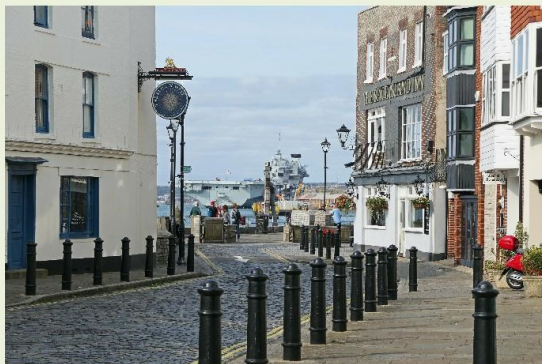
Old Portsmouth / Spice Island