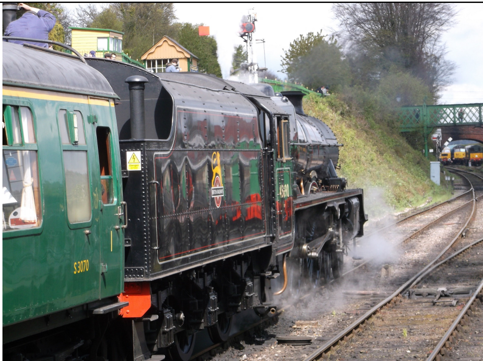
Below: Another image of “Leander” at the Gala. After Leander’s visit to the Watercress Line she went to the Epping & Ongar Railway. It was her final visit to a preserved railway, as her 10 year boiler certificate ran out in May 2024!