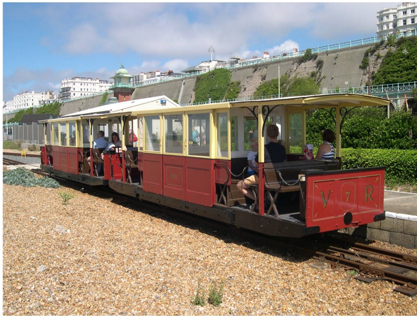
Unmistakably we are in Brighton, on the seafront, admiring The Volks Railway.

Members only visit to the Volks Railway, Brighton to include escorted tour of shed and workshops.