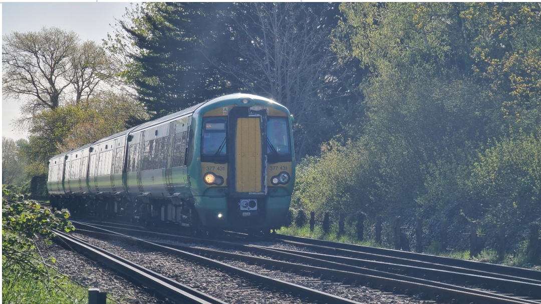
Southern EMU 377 431 is about to enter Barnham Station at 09:21 on 20th April 2024.