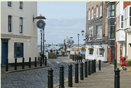
Old Portsmouth / Spice Island