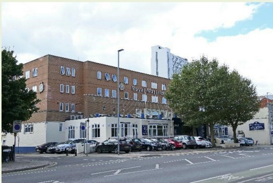
Royal Maritime Hotel