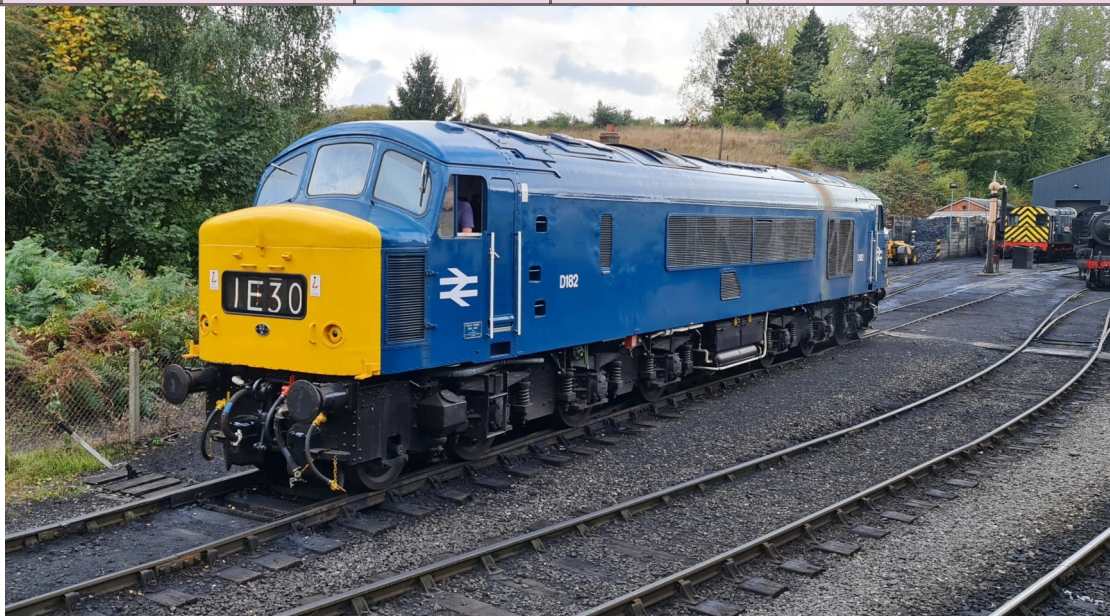
D182 Class 46 locomotive seen at Bridgenorth on the 29th September 2022.

It was attending the SVR Autumn Diesel Bash.