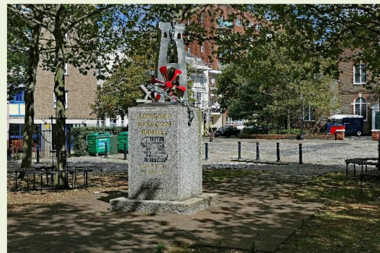
I K Brunel Born Portsea 9 April 1806