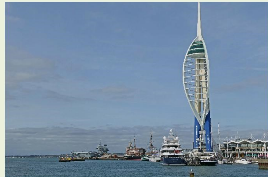
The Harbour & Spinnaker Tower