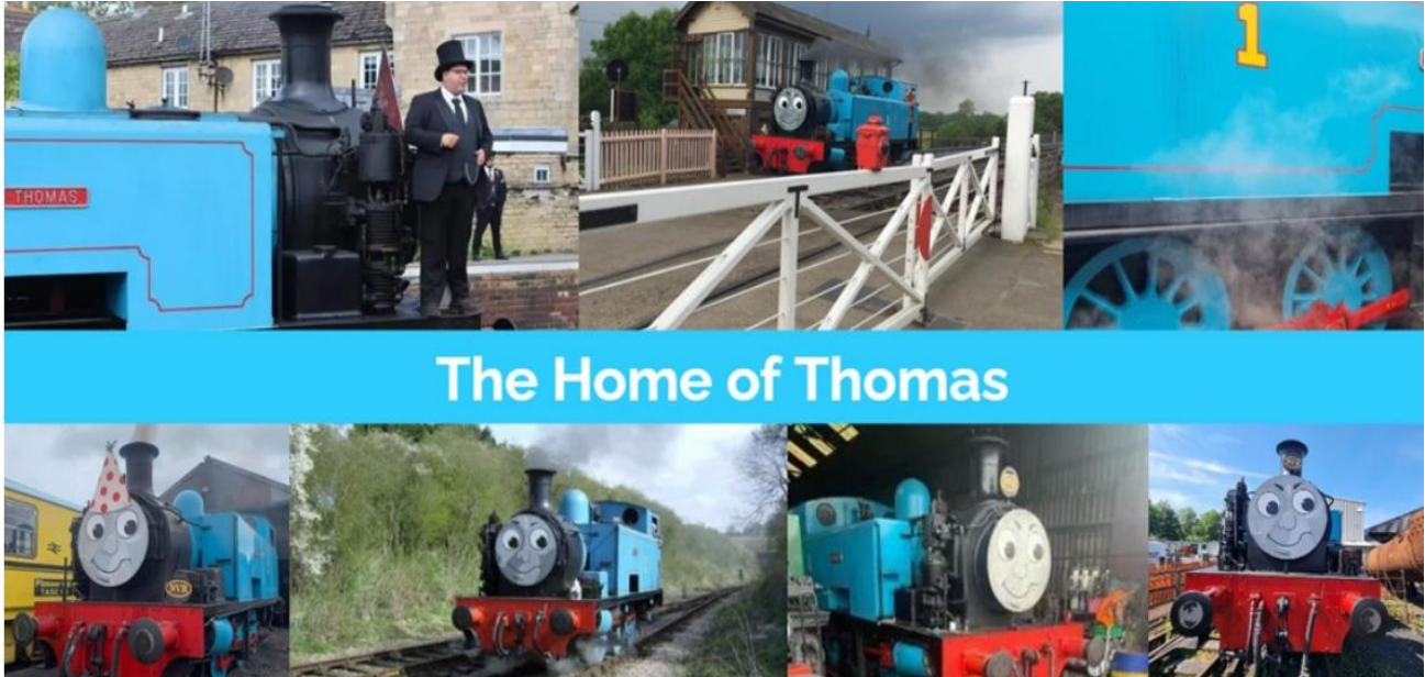
Thomas being named by Rev W Awdry

The 0-6-0T engine No. 1800 was built by Hudswell Clarke in 1947 at about the time when Rev. W Awdry wrote his second book in which Thomas appeared. The little blue engine spent its entire working life at the British Sugar Corporation Peterborough factory pushing wagons of sugar beet up an incline, until the day came when a diesel engine replaced the steam power of Thomas.