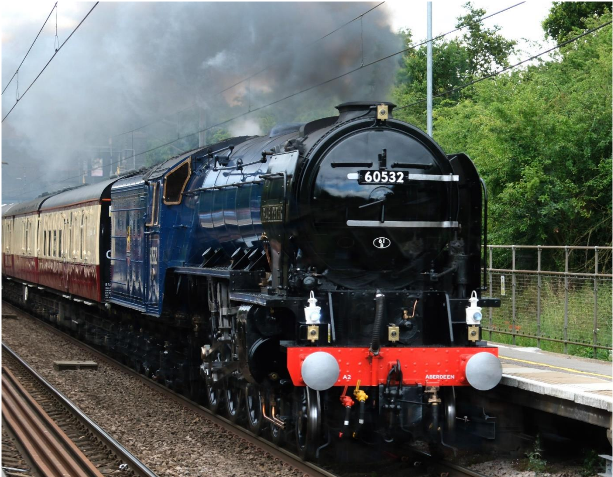
60532 Blue Peter passing Watton-at-Stone 13 July 2024

The monthly newsletter of the RCTS Hitchin & Welwyn Garden City Branch