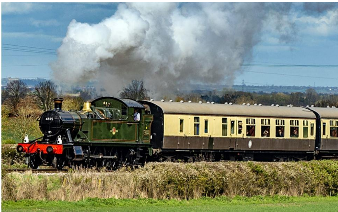
Small Prairie 4555 heads towards Keens Lane Crossing.