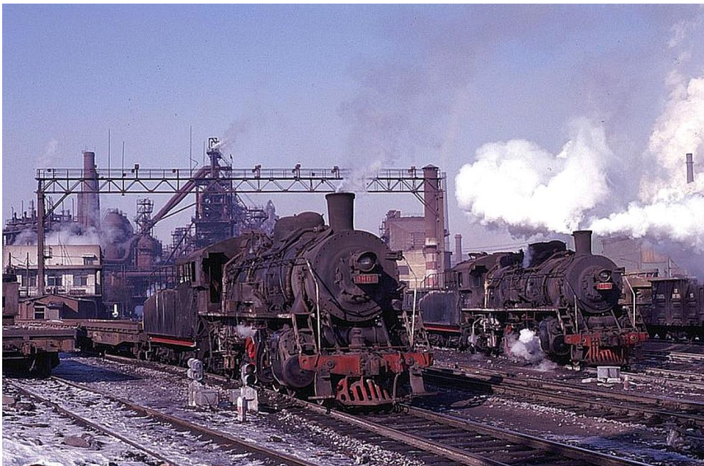
Handan 09 - SY0800 and SY1393 in yard