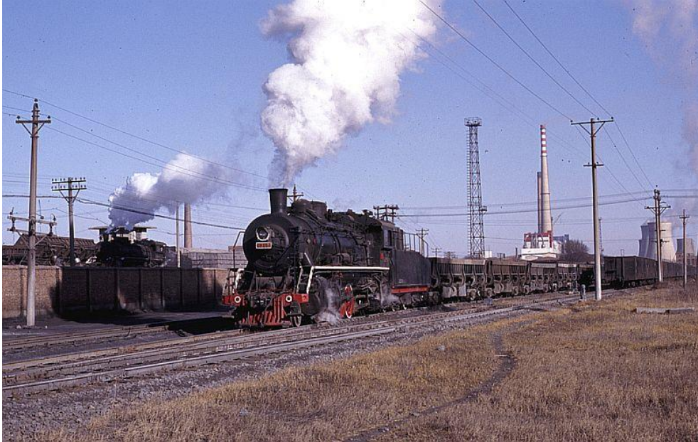
Fuxin 19 - SY1319 shunting in main yard