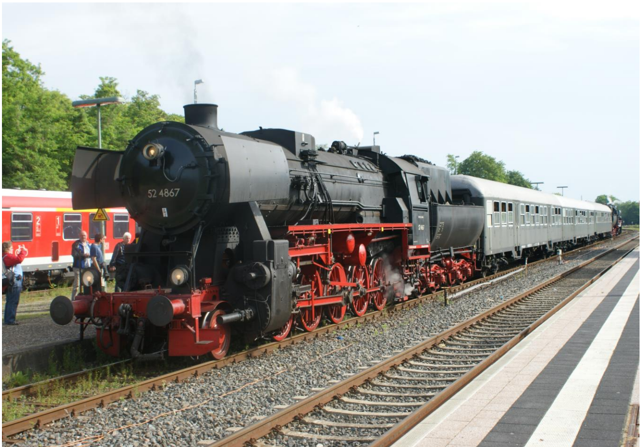
Plandampf, from "German Steam" – the March presentation at Welwyn

The monthly newsletter of the RCTS Hitchin & Welwyn Garden City Branch