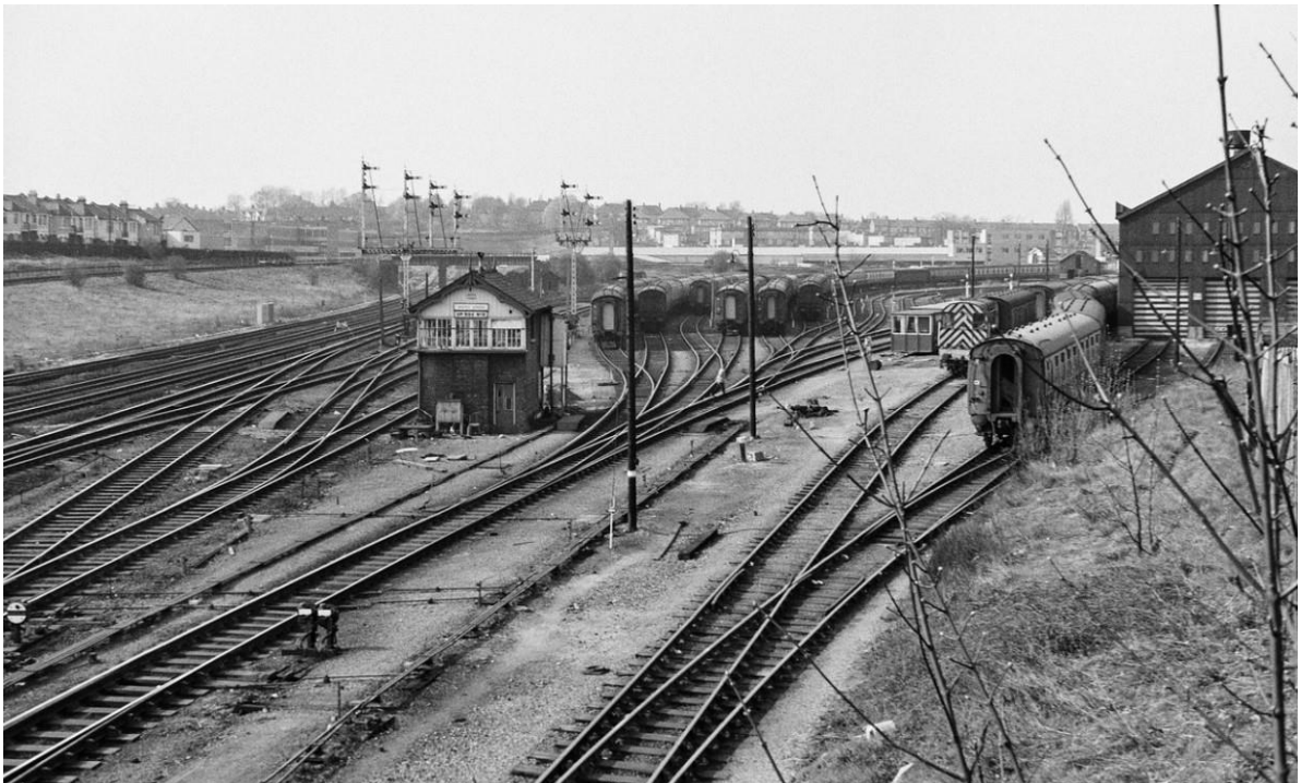
Bounds Green Depot in 1974, taken from Buckingham Road bridge looking north. Three-road repair shed on the right. The HST depot was built immediately to its left.

Palace Gates goods yard became a Charrington's coal concentration depot in 1958. Passenger services on the Seven Sisters branch ceased in 1963 and goods services in 1964. The branch was lifted in 1966. Sidings survived in the Palace Gates station area, near the site of the Great Eastern shed and at the north end of the former station platforms themselves.