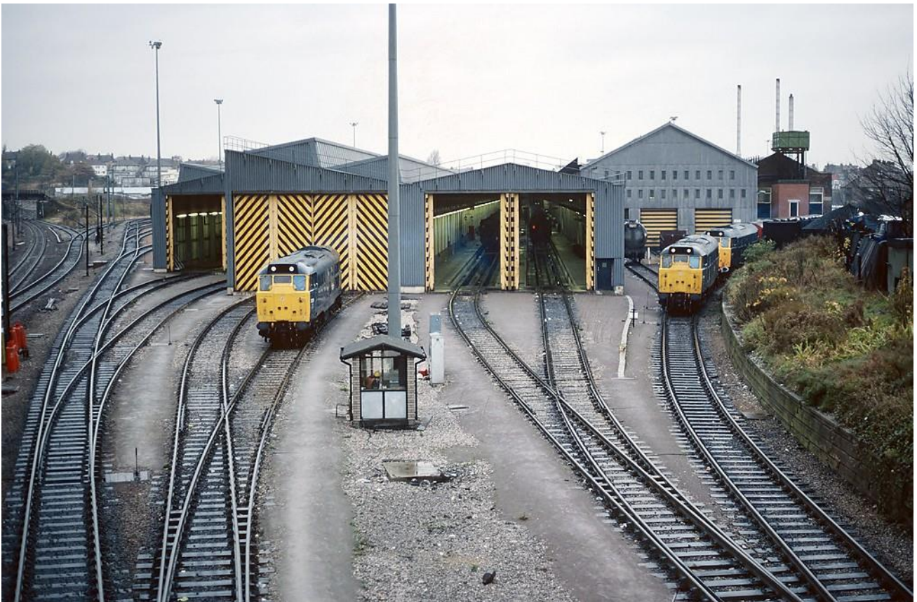
Bounds Green Depot in 1981, again taken from Buckingham Road bridge looking north. The HST depot was in its fourth year. From left to right: Up slow, Up Hertford, Depot Avoiding line (immediately to left of shed), shorter 9 & 10 shed roads, 11 & 12 roads with south end control cabin in centre, 13 & 14 roads. Three road repair shed to right and end of mess room block far right, just under water tank. Class 31s abound.

As a result of the depot's location inside the curve of the Up Hertford and the depot avoiding line, roads 9 and 10 were around a coach length shorter than the others, at around 880 feet long. Roads 11 to 14 were around 950 feet long. Roads 9 to 12 were equipped with raised rails mounted on concrete, with centre pits. Side pits and solebar level platforms (between 9 & 10 roads and 11 & 12 roads) facilitated access to different levels by maintenance and cleaning staff.