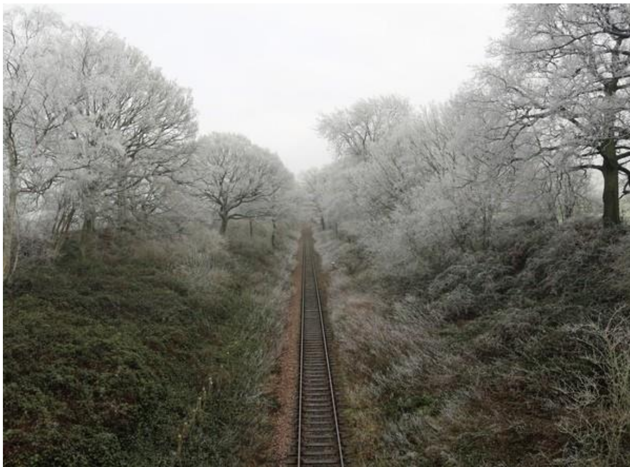
A cold wintery scene.

Following a busy 2024 season, and with the last of the successful Epping Ongar Lights Express trains having arrived back at the station, the Epping Ongar Railway is commencing its essential Winter maintenance programme. Steam and heritage diesel services, together with connecting vintage London bus services, will resume in April.