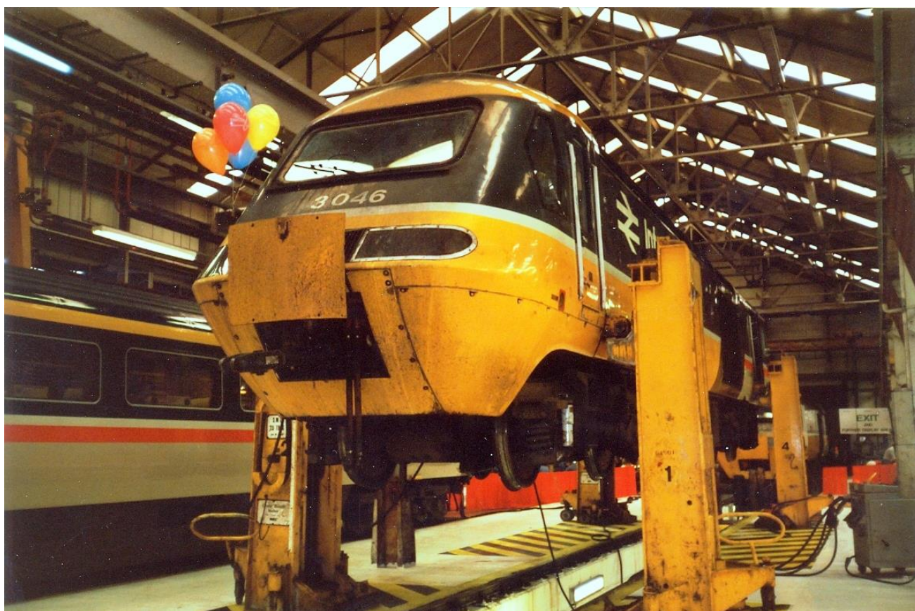
A well adorned HST power car 43 046 on the jacks on 15 road, in the repair shed. Taken during the May 1987 open day.

Bounds Green also maintained sleeper and motorail stock until sleeper services ceased on the ECML in 1988. Mk1 and 2 coaching stock continued to be maintained there.