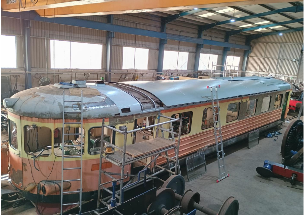
Replacement roof taking shape (12 February)