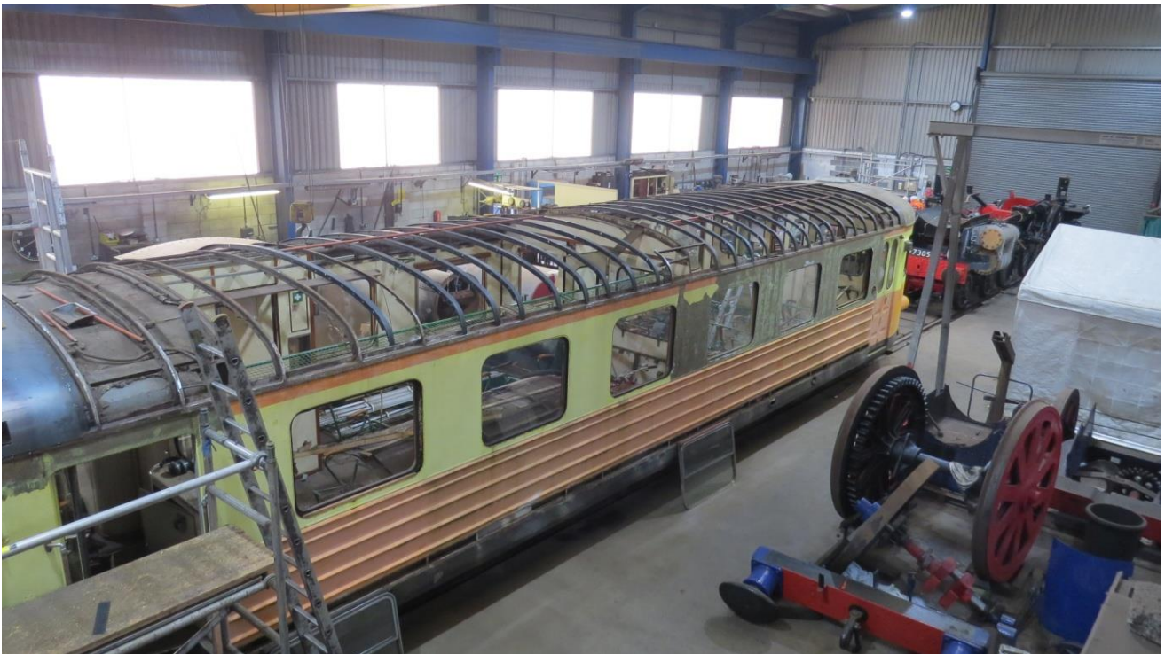
Roof stripped and new ribs in place (22 January)

As reported last month, the main activity in the Nene Valley Railway workshop revolves around reroofing the Swedish railcar Helga . This is proceeding apace and has involved fabricating new "I girder" ribs to support the roof where they had corroded.....damp British winters are worse than cold Swedish frozen ones! This involved laser cutting the curved web of the girder then welding on strip metal to complete the "I " girder shape. This is not easy without deforming the girders and was achieved within 2-3 millimetres of tolerance! There is then a plain sheet metal skin applied, followed by a ridged layer.