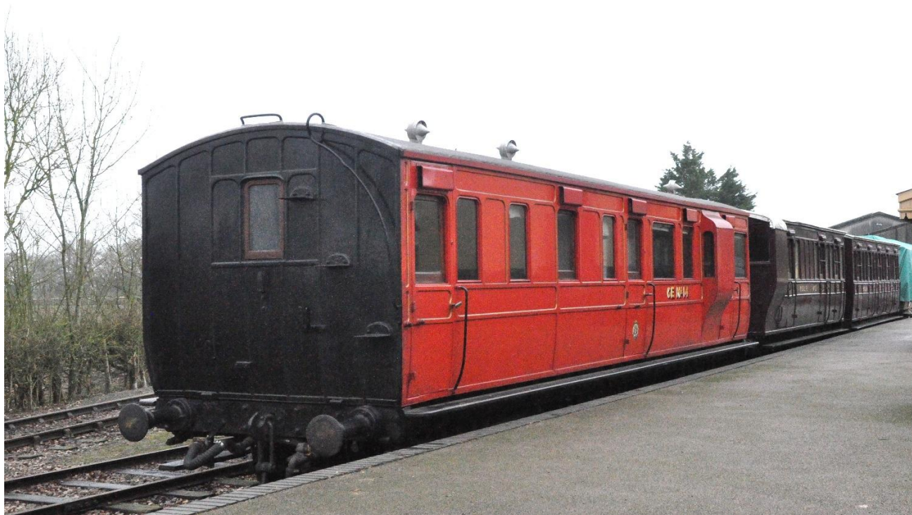
GER Saloon No14 with the other three GER coaches at the Middy

No.14 was the first GER carriage to have electric light from new. Built for observation, one end has large windows and guards-type lookouts. The main saloon originally had fixed couches either side and a table.