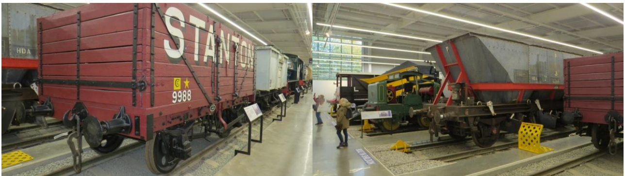
There are many contrasting types of freight vehicle both ancient and modern.