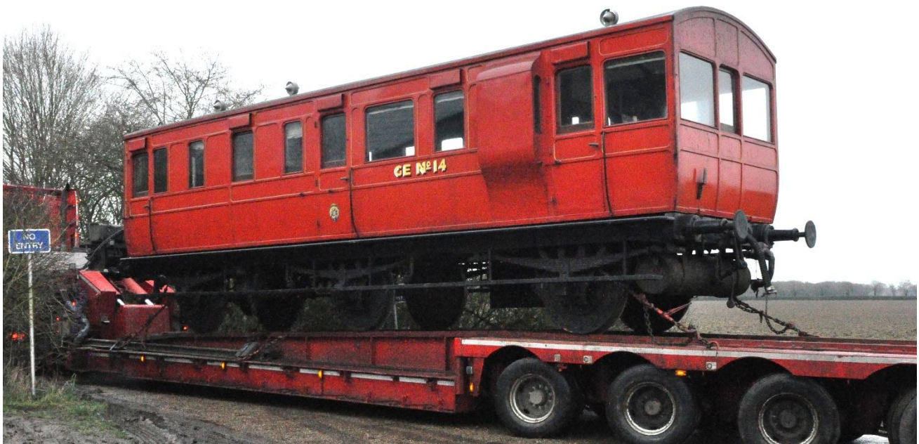
Arrival at Brockford, home of the Middy

The Mid-Suffolk Light Railway has announced the arrival of the historic former Great Eastern Railway Coach number 14, that has been bought by members of the railway.