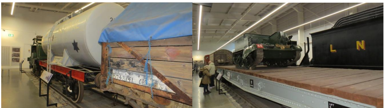
Two types of tank! Ok, I know it's a Bren carrier!