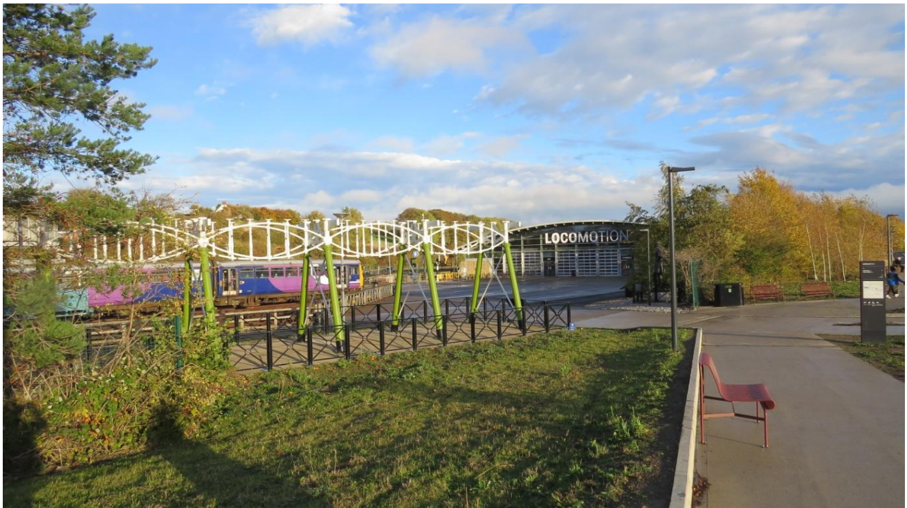
View from the new hall back to the old hall.

Sunday morning was devoted to the Officers conference, which in future years will be moved away from the member's weekend. Following the meeting, we joined the coach again to visit the National Railway Museum collection at Shildon. Many of you will have been here before so I will concentrate on the new hall which lies separately from the original building. This has meant that some of their precious exhibits can at last be accommodated under cover. There is one important fact which you should bear in mind when visiting the new building. Despite being fully accessible, it has no toilet, so leave plenty of time to scuttle back to the main building!